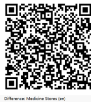
Difference: Medicine Stores (en)

( https://www.drugoffice.gov.hk/eps/do/en/consumer/news_informations/pharmacy_medstore.html )