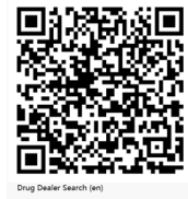
Drug Dealer Search (en)