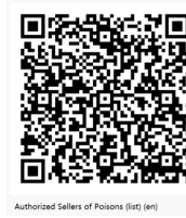
Authorized Sellers of Poisons (list) (en)