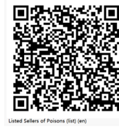
Listed Sellers of Poisons (list) (en)